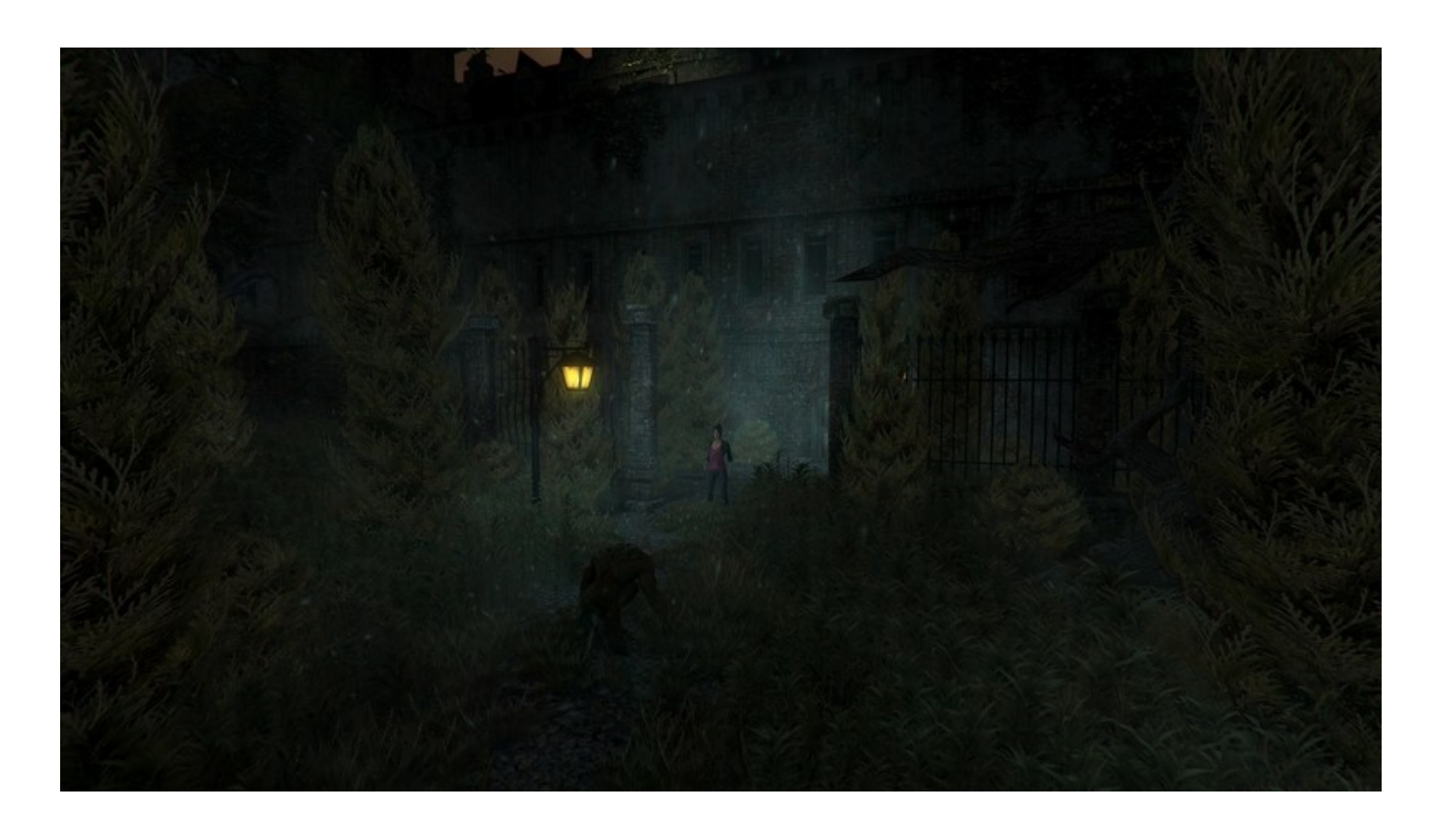
Outbreak: The Nightmare Chronicles - Season Pass Download With Utorrent